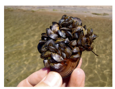
A cluster of invasive zebra mussels attached to a native freshwater mussel. Such infestations lead to the larger mussel's death.