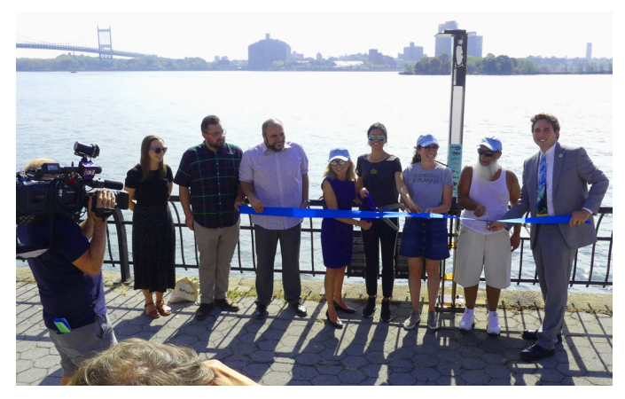
Ribbon cutting ceremony for the first ADA-compliant bait station in East Harlem.

This prototype was erected along the esplanade in East Harlem at a prime fishing spot where residents use the waterfront for recreation.