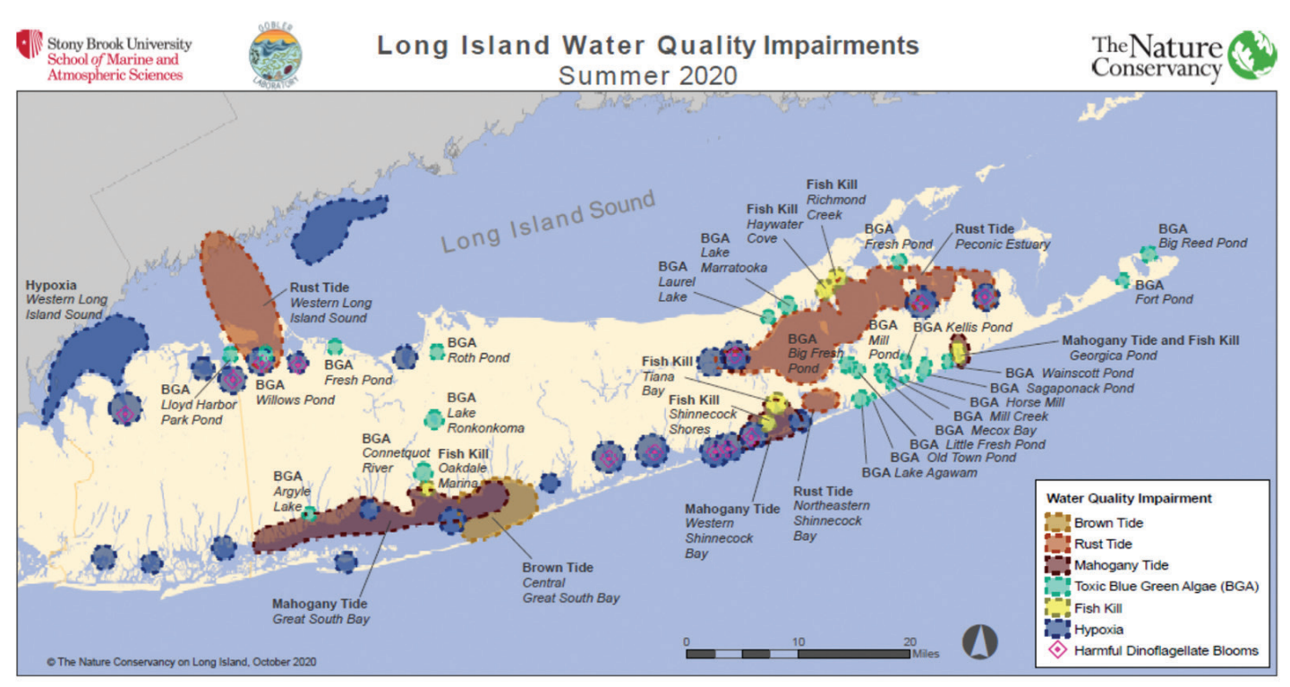
Blue-green algae blooms in inland freshwater lakes are caused by Microcystis, a potent gastrointestinal toxin. This toxin is unsurprisingly also harmful to small animals such as pet dogs that like to enjoy the waters around Long Island. Other blooms that plague Long Island waters (as featured in the summer 2020 map) include mahogany tide, rust tide, and brown tide – all of which bring negative impacts.

In Summer 2021, the Gobler Laboratory monitored a brown tide in the waters of Long Island's Great South Bay near Patchogue. Caused by the Aureococcus anophagefferens alga, this HAB is highly damaging to marine life, especially eelgrass that fish and shellfish depend on for habitat.