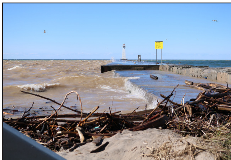
Unprecedented high water levels and record flooding in 2017 and 2019 was a challenge for coastal communities along Lake Ontario. NYSG-funded research has provided information that will help communities apply for assistance through The New York Climate Smart Communities Program.