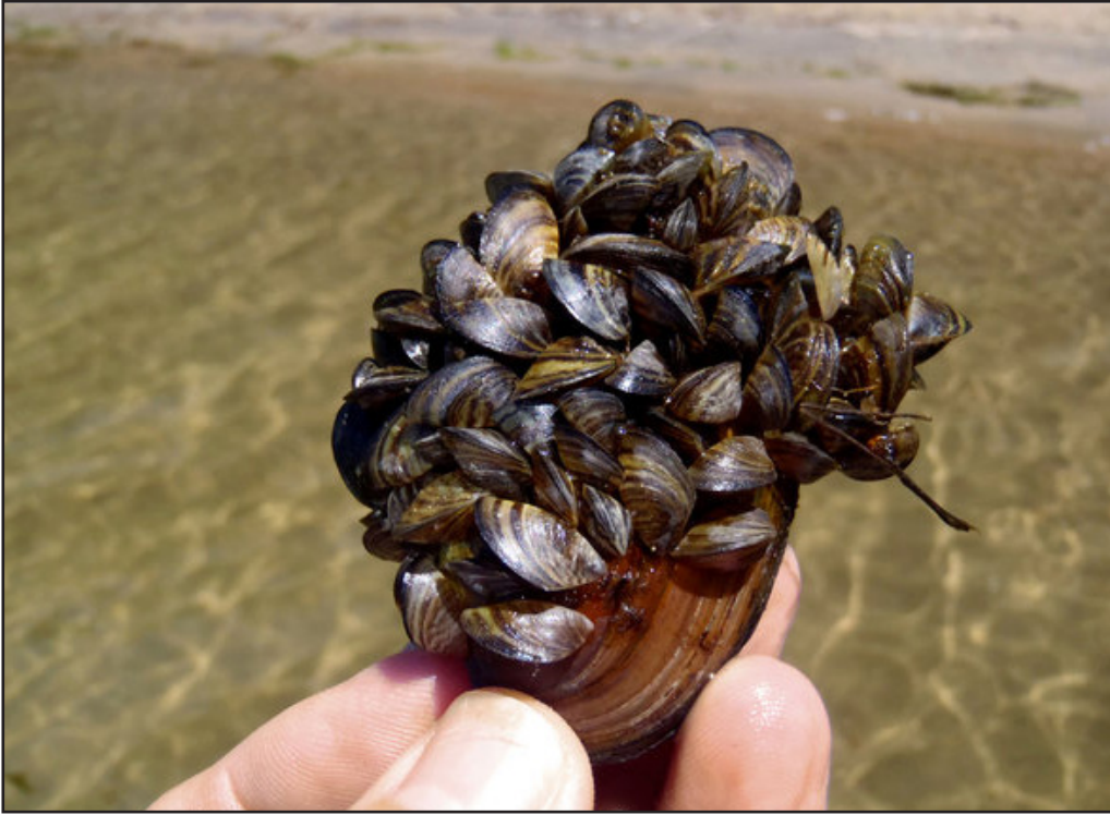
A cluster of invasive zebra mussels attached to a native freshwater mussel. Such infestations lead to the larger mussel's death.