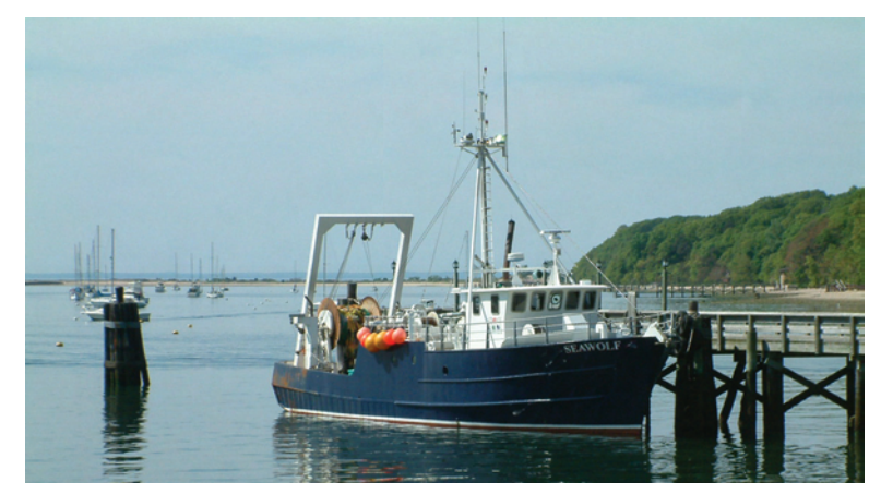
Several newly-funded projects will conduct experiments from the research vessel RV Seawolf , seen here docked in Port Jefferson Harbor on Long Island Sound.

The Sea Grant programs of Connecticut and New York have awarded nearly $820,000 in Long Island Sound Study research grants to five projects that will look into some of the most serious threats to the ecological health of Long Island Sound (LIS), a water body designated by the U.S. Environmental Protection Agency as an Estuary of National Significance.