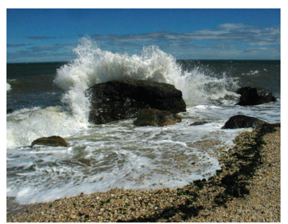
Long Island Sound, Southold, NY. The health of Long Island's estuarine resources is vital to New York's economy.

Following NYSG NEMO outreach, communities have improved construction and post-construction requirements, and procedures for site plan review and inspections. Changes include an ordinance for retention of rainwater from new driveways, and erosion and sediment controls for projects smaller than an acre. Nassau County strengthened its drainage requirements by limiting the volume of runoff allowed to be discharged into its stormsewer system and by further encouraging development practices that reduce impacts. Nassau and Suffolk counties, as well as several towns and villages, have initiated storm drain retrofit projects.